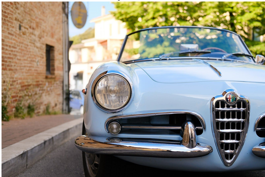
Figura 1: Carro