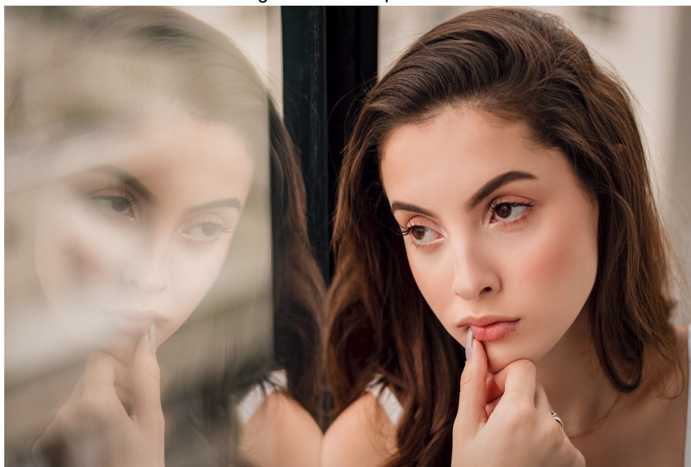
Figura 2: Mulher pensativa

Anita saved $975 for community college tuition and other expenses, but now she is confused. Her older sister is going to Hawaii next month, and she wants Anita to go with her. They can get a discount on a hotel room and share the costs of renting a car. Anita knows college is important, but she wants to visit Hawaii. The problem is she can't afford both. If she goes to Hawaii, she won't have enough Money for college. It will take her a year to save enough Money for tuition. Anita wants to be a nurse someday and work in a hospital. She doesn't know what to do. She has to make a difficult decision.